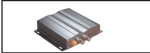
SV-DE861 Single channel Decoder

You can now integrate any camera with a Home Network or Home Automation Security System.