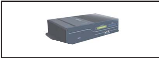
SV-861 Single channel Encoder